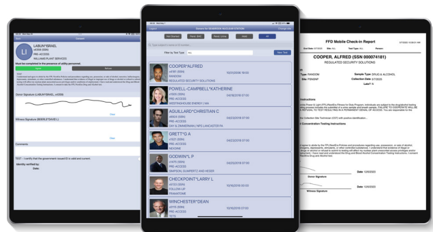
The IPAA FFD Mobile App's easy-to use interface makes completing paperwork more efficient.