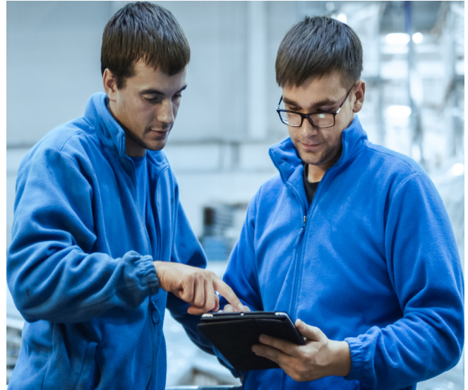
The IPAA Mobile Check-In App streamlines and simplifies in-processing tasks.