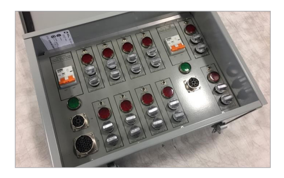
RPS Test Box