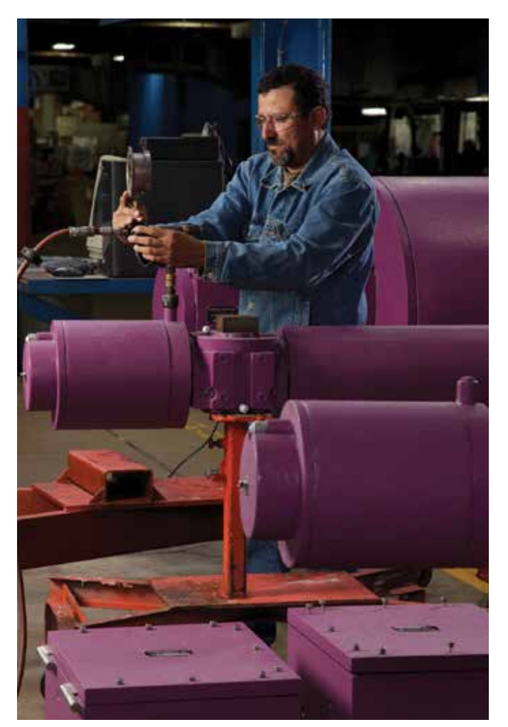
Emerson WACC can provide actuators for specialty applications such as fire-retardant coatings and treatments

Bearings assist in enhancing the cycle life of the actuators by providing smooth and consistent torque output. The CBA300 Series actuator pistons have three field-replaceable bearings. In addition, the actuator features PTFE-coated upper and lower torque shaft bearings for wear resistance, also replaceable in the field.