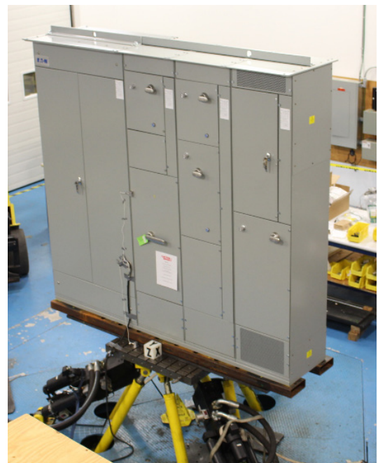
MCC (2.5m x 0.5m x 2.2m) Being Seismically Qualified In-House