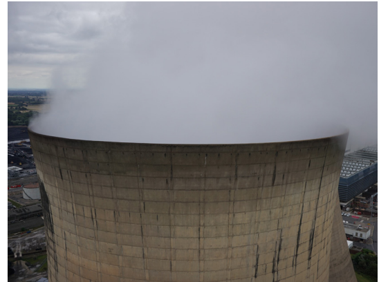
The UAS is able to reach above what would normally not be easily accessible.