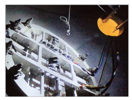
Reduced Radiation Exposure with the Zero Entry Nozzle Dam