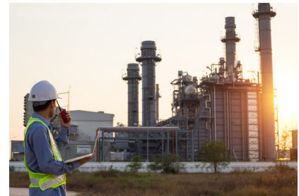
Plant engineer utilizing virtual contractor services