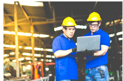
Plant engineers reviewing data sheets from Curtiss-Wright