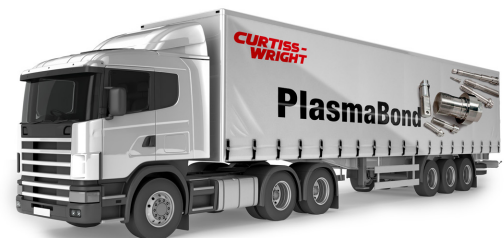
The PlasmaBond service truck is a full service mobile unit for on-site support.

CONTACT INFORMATION: 18001 Sheldon Road, Middleburg Heights, OH 44130 +1.216.267.3200